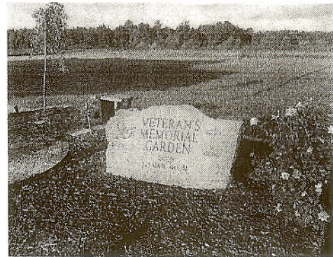
Memorial Garden Picture

After months of planning and getting things together, we finished this project in one day, June 5, 2009.